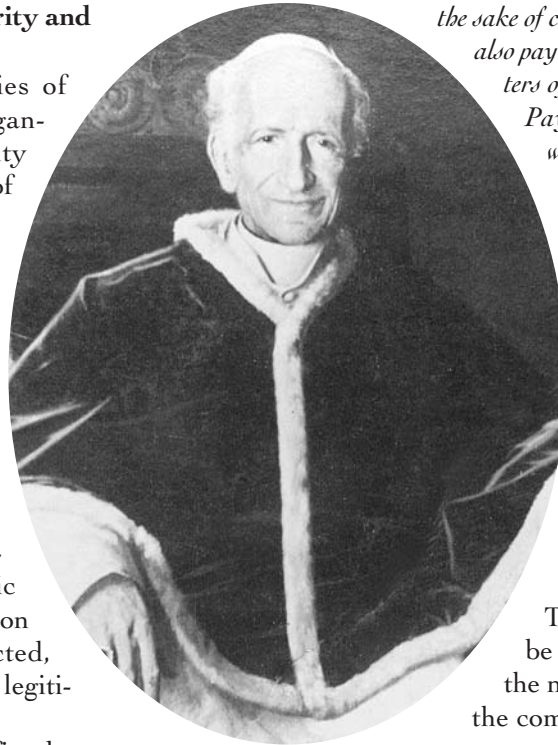
Pope Leo XIII, reigning from 1878 to 1903, issued a landmark body of teaching on the Church’s social doctrines

Civil government has been established by God to protect and promote the common good. Every human community needs authority, and all authority in civil government comes from God, as an ancient pagan king recognized: “Thus says Cyrus king of Persia: The Lord, the God of Heaven, has given me all the kingdoms of the earth” (Ezr 1:2). St. Paul teaches us: “Let every person be subject to the governing authorities. For there is no authority except from God, and those that exist have been instituted by God. Therefore he who resists the authorities resists what God has appointed, and those who resist will incur judgment. For rulers are not a terror to good conduct, but to bad. Would you have no fear of him who is in authority? Then do what is good, and you will receive his approval, for he is God’s servant for your good. But if you do wrong, be afraid, for he does not bear the sword in vain; he is the servant of God to execute his wrath on the wrongdoer. Therefore one must be subject, not only to avoid God’s wrath but also for